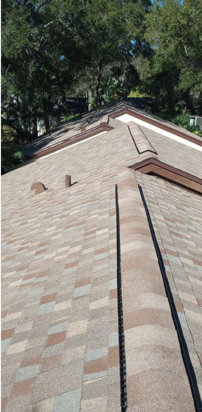
Project: STRATHMORE GATE - 4032-4036 DIAMOND LEAF CT / 2310-5005411-01 Date: 10/31/2023, 11:58am