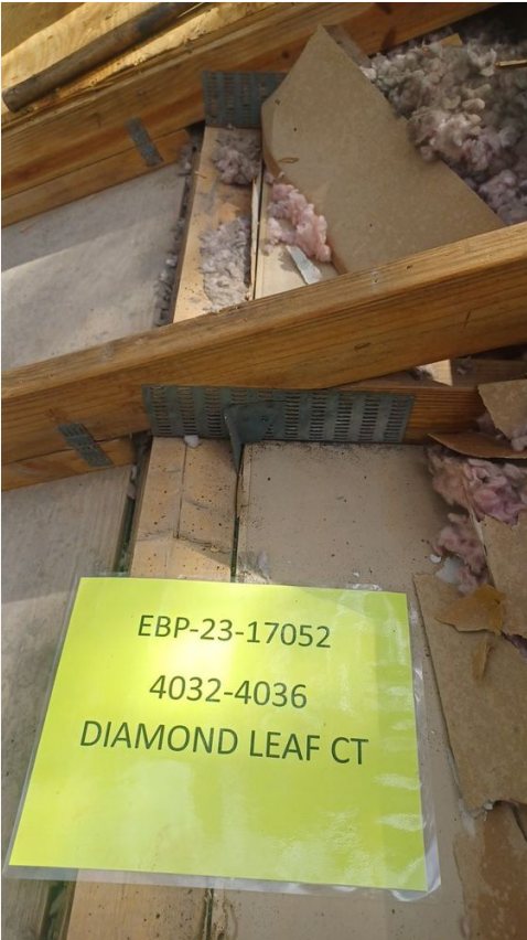
Project: STRATHMORE GATE - 4032-4036 DIAMOND LEAF CT / 2310-5005411-01 Date: 10/30/2023, 12:07pm